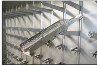
Fixation of parts during cleaning